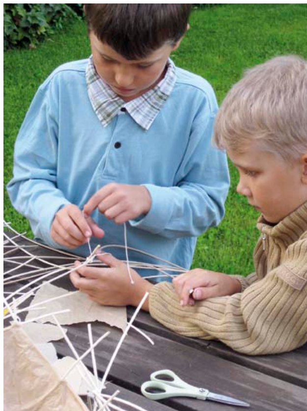
ARTS AND CRAFTS is one of the art forms taught in basic education in the arts, provided for instance by the Finnish Crafts Organization, Taito Group.