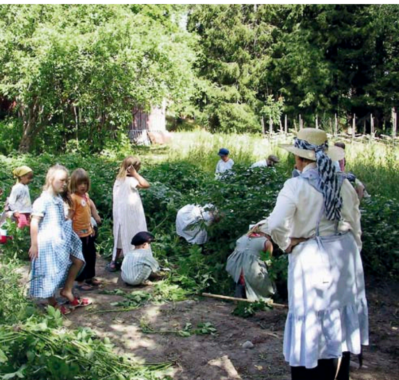
LOCAL MUSEUM SAGALUND in Kemiö passes traditions from generation to generation by means of play and activity.