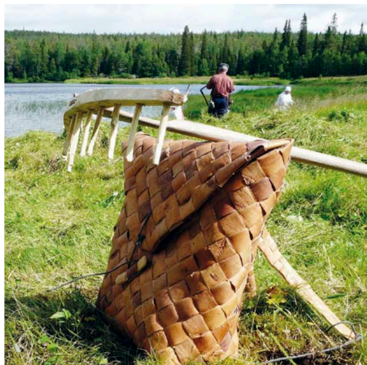
OLD TRADITIONS are interesting for tourists. Kulma-project of Metsähallitus arranged an old time moving event in Oulanka.