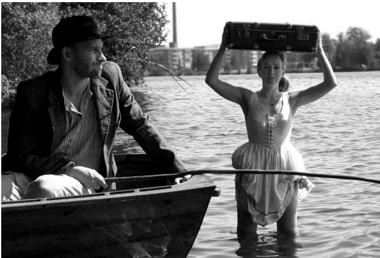
POETRY-INSPIRED DANCE production “Wading Girl and The Wanderer” at the 2008 Pentinkulma literature festival in Urjala.