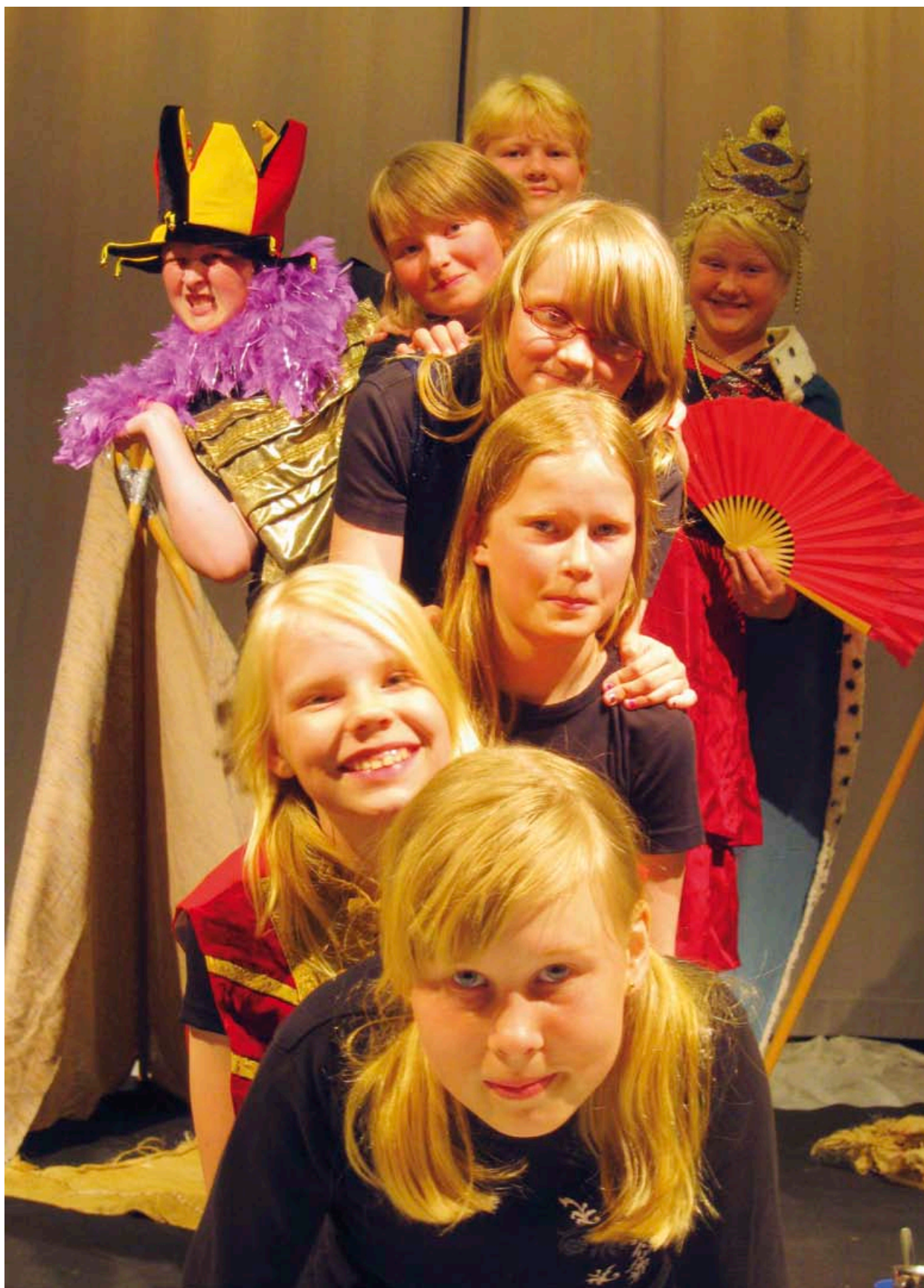
DRAMA CLASS FOR YOUTHS in Adult Education Center Järvilakeus.