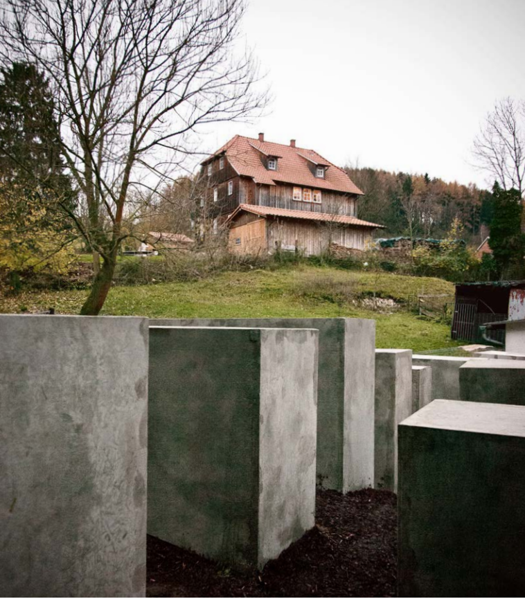
Centre for Political Beauty.

in 2017 in which called the memorial a “monument of shame.” 101 The collective was charged under Article 129 of the German Criminal Code which allows the authorities to investigate individuals for their alleged membership of criminal groups and terrorist organisations. 102 The criminal investigation was dropped in April 2019 when no clear evidence of its membership was found. The collective writes: