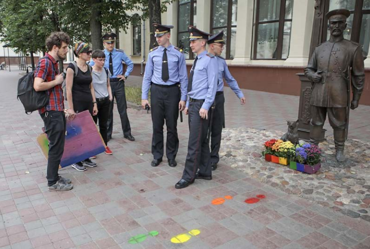
Belarus Free Theatre.

In June 2018, three protesters from the underground theatre group Belarus Free Theatre's Studio Fortinbras school were detained for 24 hours in Minsk for an artistic stunt performed by the members of the theatre group and other protesters. The peaceful stunt involved painting rainbow-colored footprints and placing flowers in front of a statue of a policeman outside the Ministry of Interior. The theatre performed the stunt to call out homophobia following the statement from the Interior Ministry. 243 They were subsequently informed they would be fined for "disobeying police".