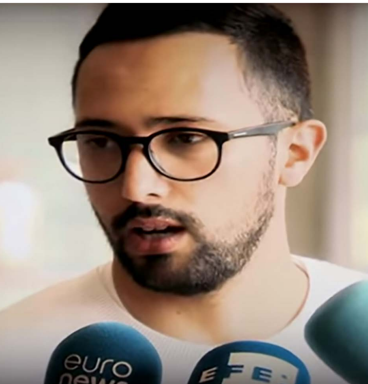
Valtonyc.

Constitutional Court was rejected, as his lyrics were rendered as constituting hate speech and were found to be personal rather than political criticism. Valtonyc subsequently fled to Belgium, prompting the Spanish National Court to issue a European and international arrest warrant against him. In September 2018, a Belgian court ruled against the request for his extradition on the basis that it did not consider his lyrics as incitement to terrorism under Belgian law. 90 At a press conference held in Brussels in response to the request for extradition, Valtonyc asserted, “I haven’t done anything but singing, my crime is being left-wing, communist, pro-independence and in Spain this is not legal and for this you’re pursued and put in jail.” 91 In September 2019, at a hearing held in the Court of Justice of the European Union (CJEU) in Luxembourg, the European Commission held that the arrest warrant for the singer issued by Spain was unlawful. On 26 November 2019, the European Court of Justice’s advocate general Michal Bobek confirmed that the arrest warrant could not be enforced, allowing for the possibility that Valtonyc’s extradition order may not be granted. 92