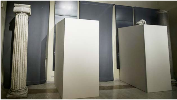
Rome.

Attempts at censorship where the work contains nudity have also been imposed at the behest of religious authorities or carried out in order to avoid offending such bodies. In August 2018, the Novosibirsk State University of Architecture and Design (NGUADI) covered naked sculptures with fabric to avoid hurting the feelings of visiting representatives of the Russian Orthodox Church. 139 In a similar episode, nude statues were covered with boxes ahead of an official visit to Rome's Capitoline Museum in 2016 as a sign of respect towards Hassan Rouhani, the President of the Islamic republic of Iran. 140