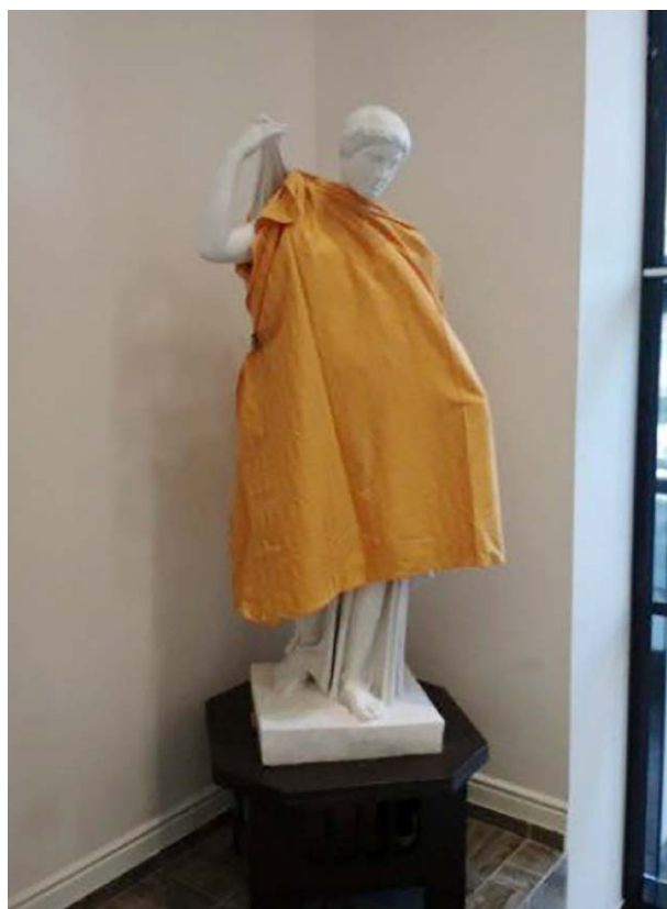
Novosibirsk.