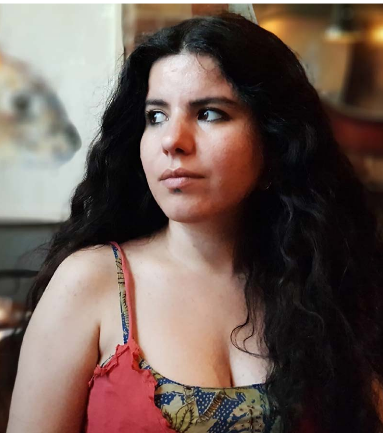
Zehra Doğan.

ZEHRA DOĞAN, FREEMUSE INTERVIEW, 3 AUGUST 2019